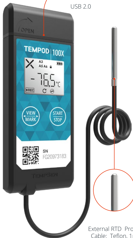
External RTD Probe Cable: Teflon, 1m